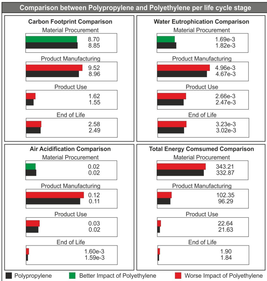
Fig. 3: The comparison of the four crucial environmental factors per lifecycle stage.

As a result, the material which was chosen for the Eco-toy was polypropylene. An additional advantage, which is worth mentioning, is the integration of the CAD module of Dassault's SOLIDWORKS™ with the Sustainability™ module. This integration is based on the direct recognition of the material and their properties for all the parts of the product's assembly. The quantities of each material, in the final product assembly, is used for the life cycle assessment. Each impact on the product's entire life cycle during the design process is examined via the extensive use of the appropriate environmental impact data provided by the worldwide leader PE International™.