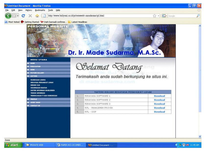
Figure 1. Personal education webpage<sup>[14]</sup>

The World Wide Web (www) is a part of network that most commonly used internet and that can accommodate graphics user interface. At first site is a collection of static documents that contain hyperlinks pieces of text and shown underlined that takes readers to other documents when clicked on. These documents are created in HTML, a hypertext markup language [10]. Now the web has evolved into an Internet-based multimedia network that provides a variety of facilities ranging from a series of static documents, online transactions, broadcast audio / video, or interactive multimedia. A web browser is a program that is run on the computer client that is used to retrieve and then display the web documents. Generally, a web browser that supports in HTML document into the main document format on the web, as well as several common image formats such as GIF and JPEG [14]. In taking documents, web browsers interact with web server with HTTP protocol (Hypertext Transfer Protocol) [11]. An individual websites supported image formats and HTML documents as in Figure 1. which is consists of many web pages. In order to read the web page required a web browser, such as Netscape Navigator software, Internet Explorer, or Mozilla Firefox from Microsoft [8].