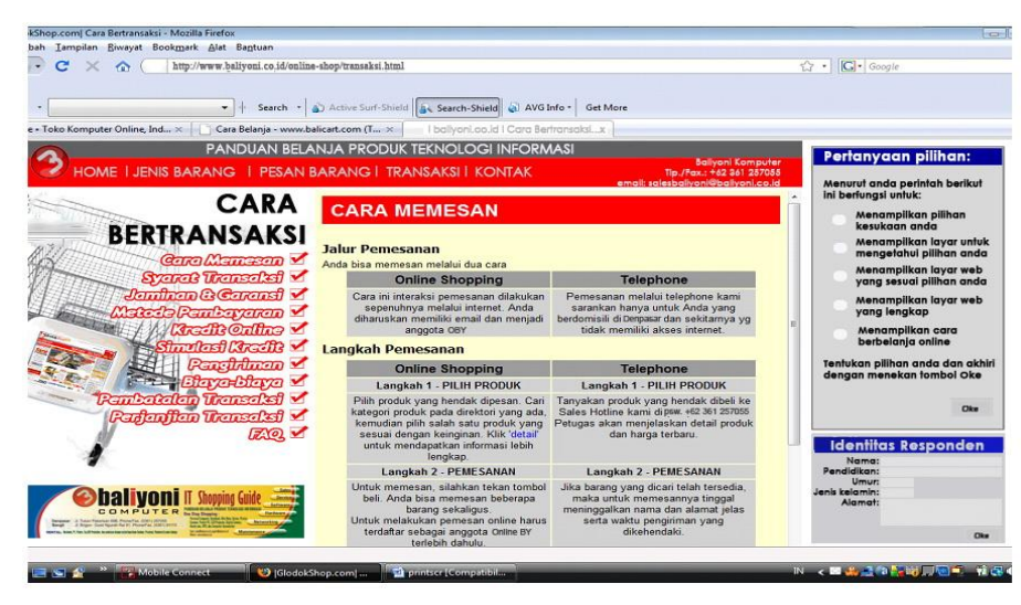
Figure 2. Indonesian online shopping webpage

The web programming written by Ruby on Rails (RoR), which the RoR is a framework for building web-based system. Rails is its framework and the Ruby is a programming language [13]. The advantages of using RoR framework is the speed of the application development and also practicing self-discipline to write code for programmers because this framework has an elbow strict rules [5]. With the existence of this rule will facilitate the process of maintenance depends on the application without a programmer only. In other words, system maintenance can be done by other computer programmers, as long as they understand the rules of RoR, then they will be able to continue the work of previous programmers. Furthermore, the questionnaire program is modeled to follow the appearance Mozilla Firefox TM 18.1, which is a web browser that is simple but has enough functionality for the beginers user. This control component has size (code size) is relatively small, simple, and has been included in PHP [2],[7] and MySQL [12]. Thus the essence of the program is a window frame that provides support for this component interface. The program is intended for Win32 B platform for PC users beginer using the operating system such as Windows TM 7, which has good stability thus strongly supports the development of software that is trial-and-error when debugging [[8]. Nonetheless, online shopping program created using the Indonesian computer instructions can be executed on the system platform.