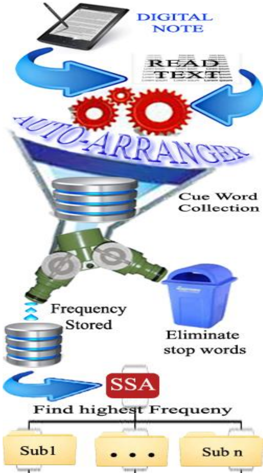
Fig. 3: A framework to enhance data Structure