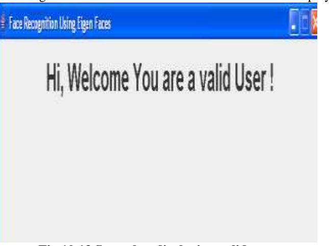
Fig 10.13 Snap shot displaying valid user

Figure shows a message. If the distance calculated is less than 5.9 it displays valid user