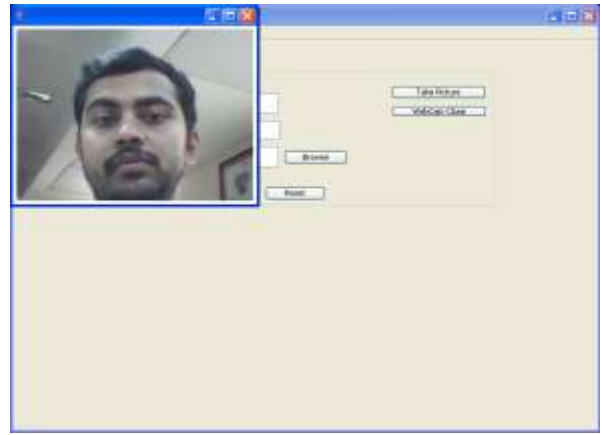
Fig 10.4 Snap shot displaying a picture

Figure shows an image, take picture, webcam close, and browse, reset. Here the user image is captured by using the webcam