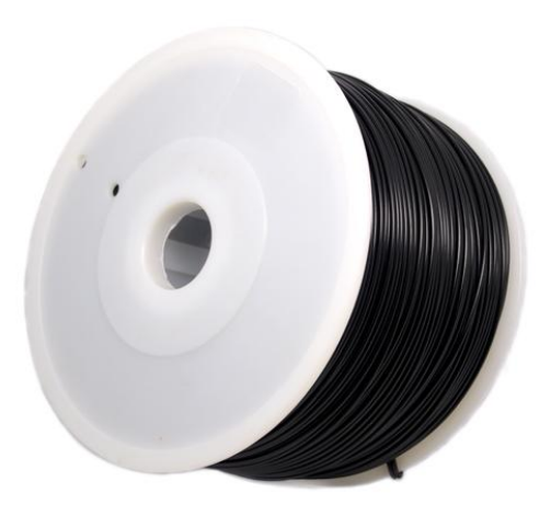
Fig. 2: Filament

The movement of the extrusion head is achieved by use of a servo motor. The nozzle can move in horizontal and vertical directions. The extrusion nozzle drives as per the path determined in the previous step. The product is printed layer by layer. The new layers bind with previous ones as they are extruded. The feed of the material can also be programmed depending on the time required for the material to fuse together. The supports can be removed manually once the product has cooled down.