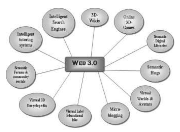
Fig.1: Web 3.0 Tools and Services

It can only tell that the keyword appears on the Web page. A Web 3.0 Agents based-search engine is created in such a way that it not only understands the keywords in your search, but also interpret the perspective of user request. It would return relevant results and suggest other content related to your search terms. Experts trust that Web 3.0 will provide users with rich user experiences. Experts also believe that with Web 3.0, every user will have a unique internet profile based on that user's browsing history. Web 3.0 will use this outline to adapt itself for the browsing experience and deliver the same to each individual. That means that if two different learners, each performed an internet search with the same keywords using the same service, they would receive different results determined by their individual profiles [8]. Students will also benefit from knowledge construction empowered by the Semantic Web. A Semantic Web Agent based search engine is expected to return a multimedia report in the form of both audio and video content rather than just a list of hits.