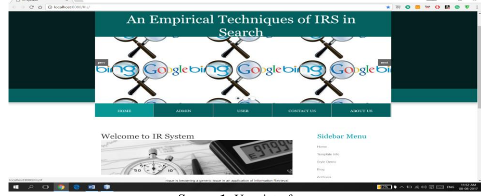
Screen 1: User interface.

These are some of the output screens captured during the execution of the project: