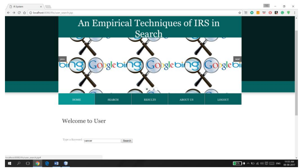
Screen 3: User search process.