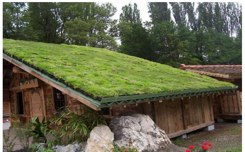
Figure 5: Example of a green roof [4]

holding heat better than the glass fiber. Painting roofs white is the easiest way of heat reflection and saving on costs in the summer. But an even better option is to plant greenery on rooftops. Roof gardens help insulate the building in winter and absorb rainwater in summer, reducing water pollution in urban runoff (Fig. 5).