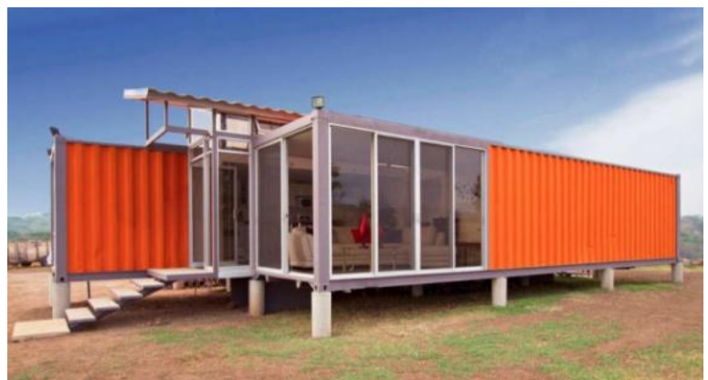
Figure 2: Eco-house built from shipping containers in San Jose (Costa Rica) [2]

In this case, two containers are placed on the sides for a higher common space in the building. The bedrooms are placed inside the containers, while the entrance, dining room, living room and attic are located in the center of the structure. The eco-house is not connected to the power line, using solar orientation, passive cooling, green roofs, furnace heating, and solar panels to create electricity. Fig. 2 shows an eco-house built from shipping containers in San Jose (Costa Rica). Such house construction was dedicated to provide spectacular views of the natural landscape (large transparent windows used for this purpose). The roof between the two containers is made of scrap metal.