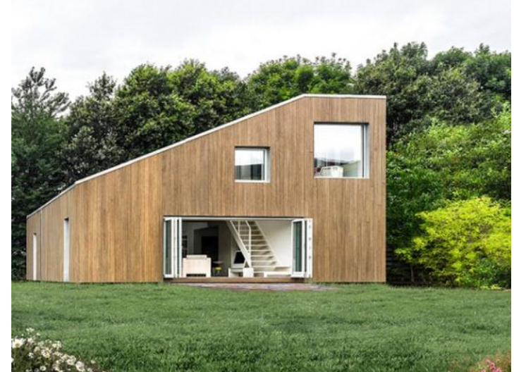
Figure 1: An example of a two-storey building made of shipping containers [1]

In this case, two containers are placed on the sides for a higher common space in the building. The bedrooms are placed inside the containers, while the entrance, dining room, living room and attic are located in the center of the structure. The eco-house is not connected to the power line, using solar orientation, passive cooling, green roofs, furnace heating, and solar panels to create electricity. Fig. 2 shows an eco-house built from shipping containers in San Jose (Costa Rica). Such house construction was dedicated to provide spectacular views of the natural landscape (large transparent windows used for this purpose). The roof between the two containers is made of scrap metal.