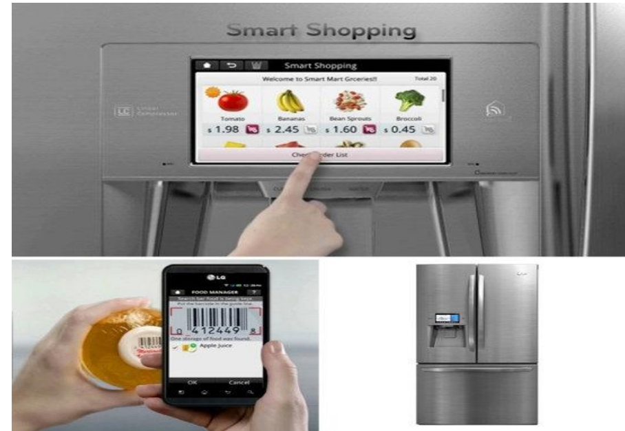
Figure 9: Dyssekilde eco-village [8]

view to successfully operate independently of the usual power line. In other words, they provide consumers with their own energy through renewable energy sources. The value of "zero" threshold applies to both energy consumption and carbon dioxide emissions: such buildings consume a small amount of energy during the year and do not produce emissions of carbon dioxide, as they use renewable energy sources such as solar or wind energy. Houses with zero energy consumption (also called passive houses) are specially constructed so as to be extremely energy efficient, from a variety of insulation materials and using modern methods of construction, such as passive solar design. These projects use complete solutions: wind and solar collectors are sometimes combined with heating with biofuels. The construction of buildings with zero energy consumption is most effective in small towns where a few houses can benefit from a common renewable source, for example, like in the Dyssekilde eco-settlement in Denmark. This eco-village consists of 74 unique blocks of flats, which vary according to the type from the hobbit style thatched houses to the most modern buildings (Fig. 9).