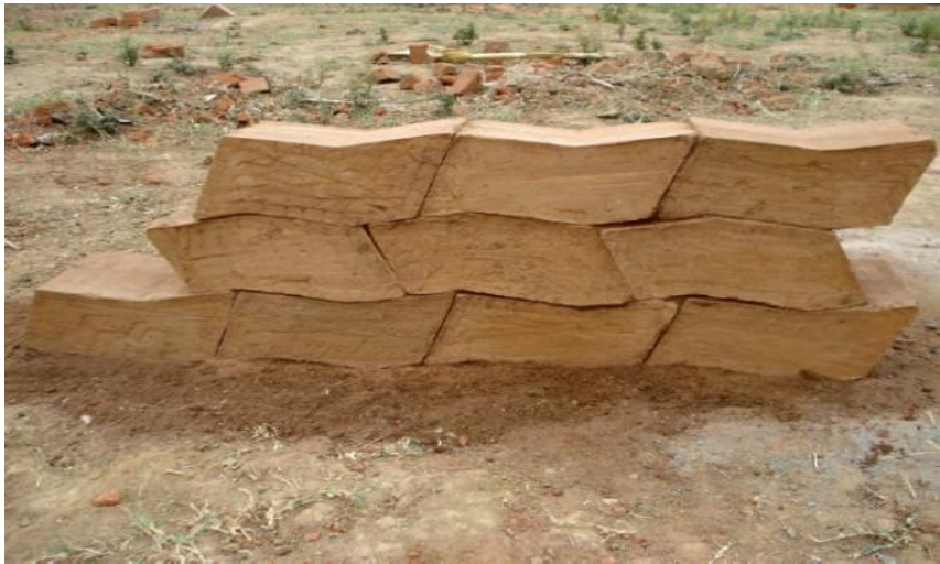
Figure 4: Earthen building blocks [3]

Deep overhangs and trellises provide shade in the summer to minimize cooling costs. The only place where the natural gas is used in the house is in the kitchen (for cooking). While straw walls are north and west oriented, the south wall of wooden frame has a lot of windows bringing natural light in the living quarters. Abundant natural light, LED lighting, and energy-efficient appliances let keep energy consumption to a minimum. Hot water is produced with a heat pump. Solar panels on the roof can compensate for power consumption. Using rammed earth as a building material is one of the most ancient techniques (Fig. 4).