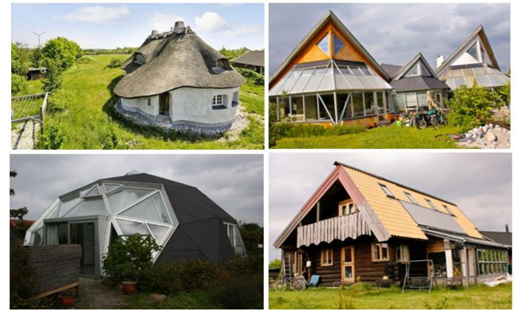
Figure 8: LG Smart refrigerator [7] All these technologies are designed to reduce energy consumption and to bring a house to the ideal state, which is usually called "zero consumption".Buildings with zero consumption are those constructed with a

The opportunities to reduce energy consumption are largely related to the use of modern household appliances with a greater degree of energy efficiency. Modern refrigerators, washing machines and dishwashers include smart meters collecting data in real time and able to share it with different devices for a more efficient use of energy. For example, LG's smart appliances can determine current energy rate and start automatically when it is cheaper. Modern refrigerator can keep track of the product expiry and notify you by smartphone which of the products you lack by constantly updating your list of products in a mobile application (Fig. 8).