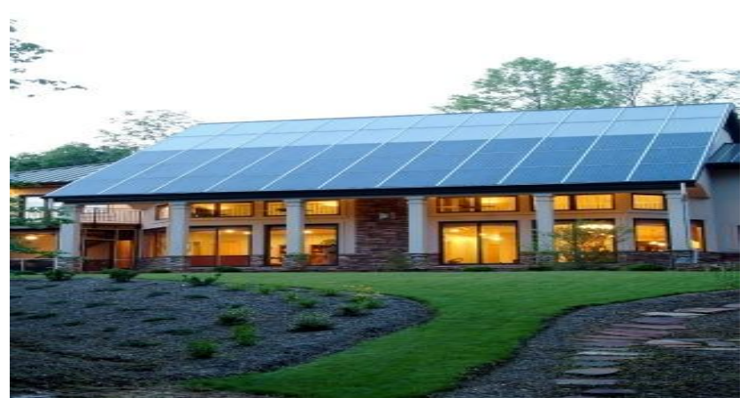
Figure 6: An example of using passive solar energy for heating and lighting of an apartment house [5]

The plants can be used to control the flow of rainwater, and the ground can be used to produce heat. As with wind and solar energy, geothermal energy is an efficient source of renewable energy, which is much more environmentally friendly than coal or gas. Pipes, buried several meters underground, avoiding the effects of temperature change. The temperature of the earth even in the winter period remains at 15oC, making it a warm source of energy in winter and a source of coolness in the summer. Water / antifreeze mixture is pumped through pipes under the ground to collect the thermal energy and is then directed to a heat pump and used for heating or cooling a residential building. reen building is primarily associated with the proper use of passive solar energy for heating and lighting of a house. Large windows may fill the house with heat and air vents can help spread the warm air throughout the room. An example of using passive solar energy for heating and lighting of an apartment house is shown in (Fig. 6).