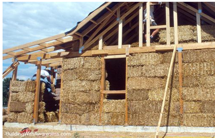
Figure 3: Straw-Bale House [3]

Deep overhangs and trellises provide shade in the summer to minimize cooling costs. The only place where the natural gas is used in the house is in the kitchen (for cooking). While straw walls are north and west oriented, the south wall of wooden frame has a lot of windows bringing natural light in the living quarters. Abundant natural light, LED lighting, and energy-efficient appliances let keep energy consumption to a minimum. Hot water is produced with a heat pump. Solar panels on the roof can compensate for power consumption. Using rammed earth as a building material is one of the most ancient techniques (Fig. 4).