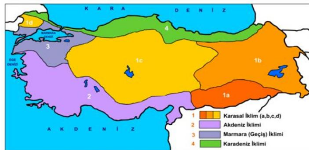
Figure 1: Turkey climatic zones (Atalay, 1997)

Climate and temperature, which is one of the most important reference points of environmental parameters, differ according to the geography and region. Changing humidity and temperature averages due to the influence of Köppen's geography and topographic conditions are classified in five different climate classifications around the world (Chen and Chen, 2013). Turkey is also located on the temperate climate of these climate types. Referring to Turkey's climate zones according to climatic variability in characteristics is seen as having one of the characteristics of a region can experience four seasons (Figure 1).