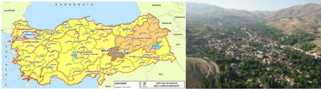
Figure 3: Location and general view of Yeşilyurt (Yeşilyurt Municipality, 2017; URL 2)

Throughout history, Malatya has been an important transit point between the east and west of Anatolia (Figure 3). The city is located on the 'silk road', which passes through the Southeast Region, Gaziantep and Malatya, on Thrace and on the Aegean, Black Sea and Mediterranean coasts to reach Europe via important ports (URL 1). The fact that it is on this historical trade route has made Malatya rich in cultural and architectural heritage as well as economically. Traditional residential areas, one of its architectural richness, feed the city from many branches, and traditional buildings that adorn these areas add a different spatial value to this city (Figure 3). These structures have many important design principles; The most important of these are the principles that take into account the natural / structural environment and climatic values and the success of planning and implementation in the parameters it has in terms of energy use.