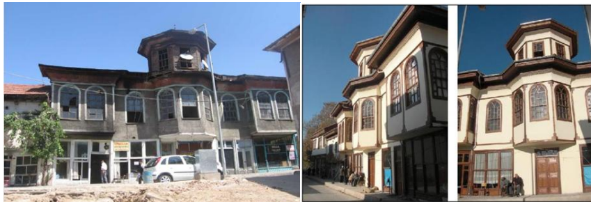
Figure 5: General view of HanifiTanbay House before and after restoration (Durgun, 2006; Malatya Governorship, 2012).

Malatya is a city with a decent and conservative social structure, which is also embedded in the common urban culture of the Southeast and Eastern Anatolia Regions. Although the city is on the Silk Road and is home to many ancient cultures and civilizations, it has managed to maintain and maintain its conservative social structure spirit. As well as its tendency to live intangible cultural heritage values in urban spaces, it has succeeded in transferring its 'traditional buildings and streets' with concrete cultural heritage values to today's generation (Figure 4). The street structure was constructed with a structure scale and height ratios that will not interfere with each other's daylight and heat together with the tissue that feeds the neighborhood units, and street silhouettes were created with this sensitivity.