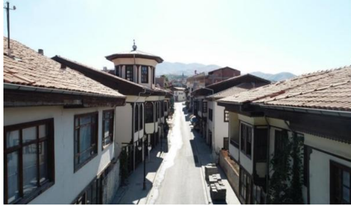
Figure 4: General view of the street where HanifiTanbay House is located (Karaarslan and Çelikyay, 2019)

Malatya is a city with a decent and conservative social structure, which is also embedded in the common urban culture of the Southeast and Eastern Anatolia Regions. Although the city is on the Silk Road and is home to many ancient cultures and civilizations, it has managed to maintain and maintain its conservative social structure spirit. As well as its tendency to live intangible cultural heritage values in urban spaces, it has succeeded in transferring its 'traditional buildings and streets' with concrete cultural heritage values to today's generation (Figure 4). The street structure was constructed with a structure scale and height ratios that will not interfere with each other's daylight and heat together with the tissue that feeds the neighborhood units, and street silhouettes were created with this sensitivity.