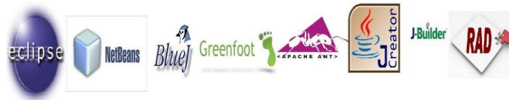
Fig. 1.3 Java Tools