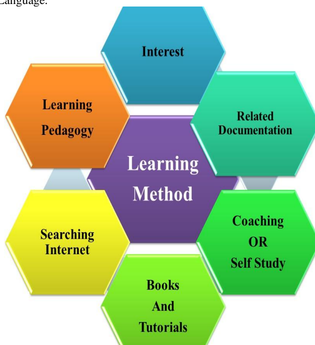
Figure 1.1 Java Learning Method for Student

This is the model of the learning Java programming Language for student in easy way, it is following the steps of learning Java programming Language.