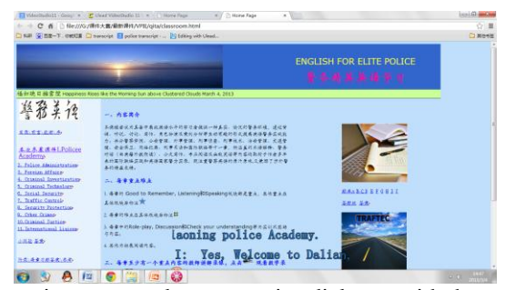
Fig.3: A student acting one speaker to practice dialogue with the computer