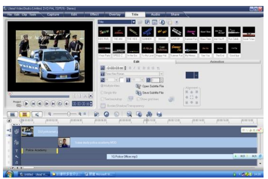
Fig.2: Editing of the transcript for Unit 1 Police Academy

Design of dialogue with the computer: To train the students oral English, an audio transcript clip is separated into two categories for each speaker, only one speaker's category is placed in the track with the interval of the other speaker silent, the scripts of the silent speaker is edited with the lyric editing tool LRC and Winamp player before the shared audio is played by a music player. The student can act the silent speaker to talk with the computer, with optional lyric display on the screen when studying on English for Elite Police Network as shown in Figure 3.