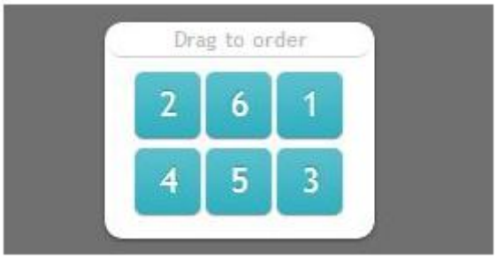
Fig. 3. Motion CAPTCHA

a) With the random registration input use the live captcha [6] to test the user that he/she is a human. As shown in picture below the user has to arange the numbers in the orde which a human can only solve not a bot.