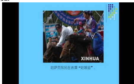
Fig. 5: Xinjiang cultural ppt: the young people of Kazak nationality are

The English teacher, functioning as the cultural bridge, has the inescapable duty to transmit the best of the Eastern and Western cultures. The integration of multicultural education into English class is the best combination. [7] The author as the English teacher of 5 peoples including the Han nationality (72 percent of the total students), the Uygur nationality (10 percent), the Mongolian nationality (5 percent), and the Kazak nationality (3 percent) attaches much importance to intercultural or multicultural education in her English class. She introduces theoretical foundation as the first English class, putting forward 4 basic principles in English class to follow: to respect all the students, and every student is encouraged to participate into the class activities equally; to respect all the students' languages (though English is the main language in use), and they can use their native tongues if necessary; to promote multiethnic cultural exchange and understanding through regular cultural introduction and interaction; to enhance the students' cross-cultural communication competence by intentional teaching and training in and after English class. In order to present her students abundant multicultural knowledge, she specifically made a lot of cultural ppt's entitled The Cultural Journey Series, Figure 5 and 6 are some of them which display unique characteristics of minority culture in Xinjiang and Indian culture in North America.