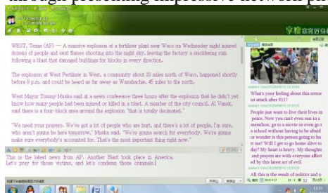
Fig. 3: Learning assistants are sharing the latest news reported by AP, a massive explosion at a fertilizer plant in West, Texas.