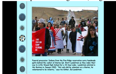
Fig. 6: American native cultural ppt: an Indian funeral procession to commemorate an Indian warrior killed in Iraq on January 7, 2006.

performing one of their traditional sports Guniang Zhui (the girls are pursuing the boys).