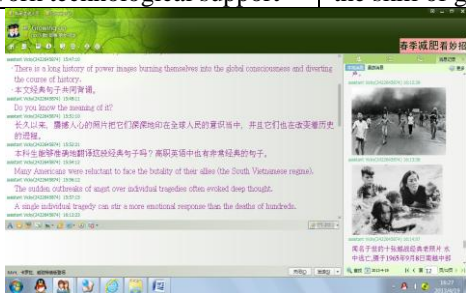
Fig. 2: Learning assistant Vicky (the group leader) are teaching the text Some Photos Make History through presenting impressive network photos taken in Vietnam War.