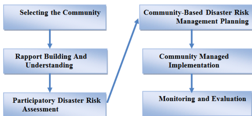
Figure 1. Disaster risk reduction process (ADPC 2006)

The stages in the disaster risk reduction process are given in the figure below: